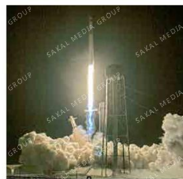
मेरीट आयलँड : फ्लोरिडा येथील केनेडी अवकाश केंद्रावरून उड्डाण करताना 'फाल्कन-९'.

'स्पेसएक्स'ने दोनच दिवसांपूर्वी आंतरराष्ट्रीय अवकाश केंद्रातून चार अंतराळवीरांना कुपीच्या साह्याने पृथ्वीवर आणले होते. वास्तविक, नियोजनानुसार नव्या चार अंतराळवीरांचे स्वागत करून हे आधीचे चार जण पृथ्वीवर परतणे अपेक्षित होते. मात्र, गेल्या आठवडाभरापासून खराब वातावरणामुळे उड्डाण अनेकदा पुढे ढकलले गेल्याने हे नियोजन फसले. मात्र, काल रात्री नासा आणि स्पेसएक्स यांनी केनेडी अवकाश केंद्रावरून प्रक्षेपण करण्याचा निर्णय घेतला. 'नासा'कडे झालेल्या